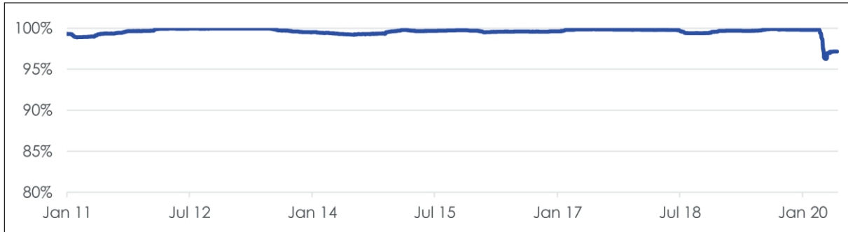
Figure 2: One-year rolling correlation between the Multi-Tenor Index and the Original Index

1st January 2010 to 12 October 2020. Using daily returns and calculating over 252 business days for each period. Above numbers include back-tested data. Historical performance is not an indication of future performance and any investments may go down in value.